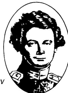
Frederick William IV